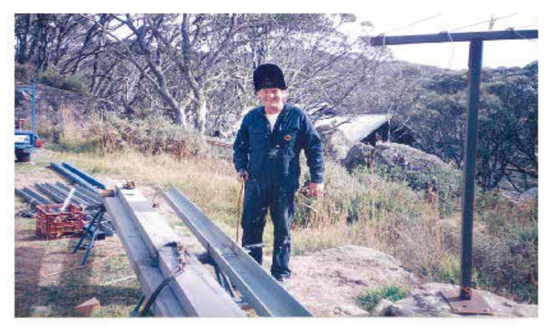
Chic assembling the Steele Northern Deck, Perisher Lodge, 1997