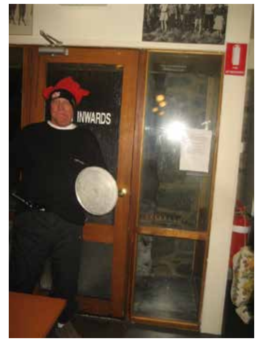
Chic joining in the activities.